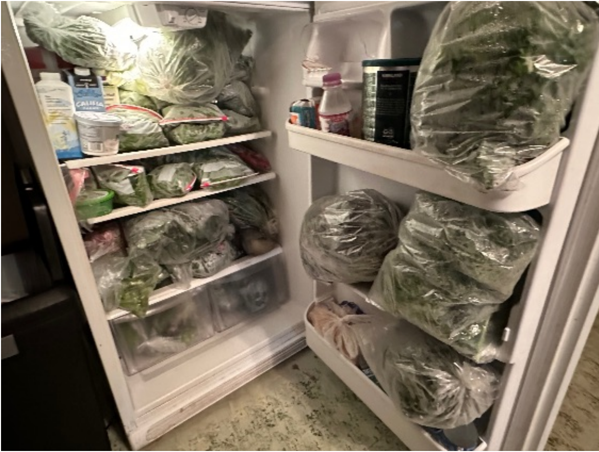
The trailer refrigerator was filled to capacity with greens for Micah 6 recently.